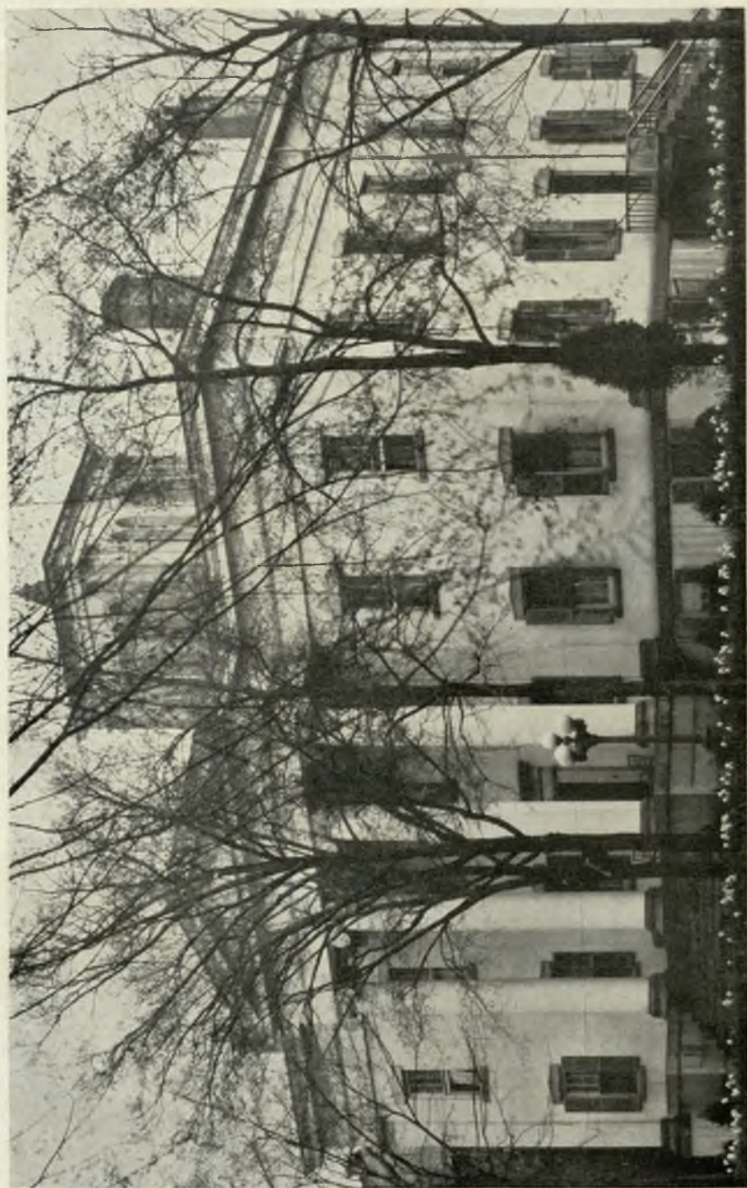
Executive Mansion, built by Georgia, 1838, now home of G. S. C. W.'s President.