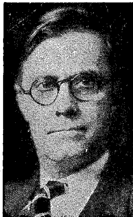
Gov. Eugene Talmadge