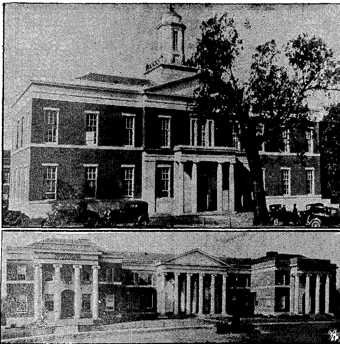
Front and Side View of New Building