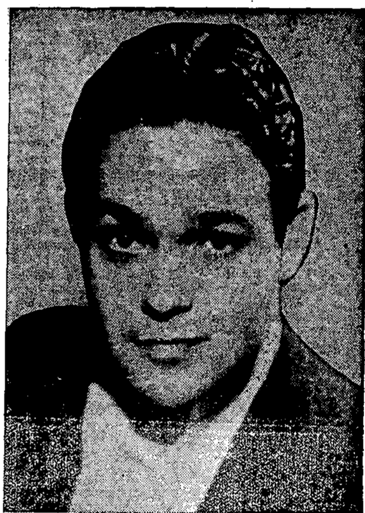
JAMES MELTON, who will appear as one of the features of the 1938-39 Milledgeville Concert Series.