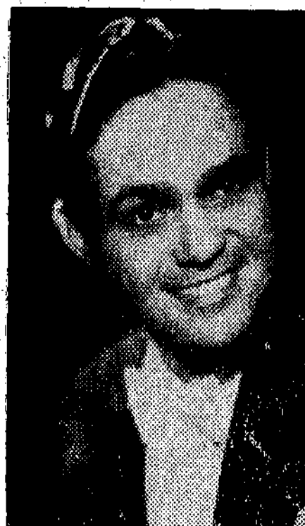
Cracker Crooner comes to Campus in cooperative concert! James Melton, star of screen, radio, and opera will be seen here on