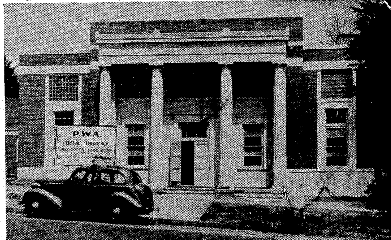
This handsome new building—a $100,000 teacher training building at Georgia State College for Women in Milledgeville—was formally accepted by the State Board of Regents this week. In addition to receiving training on the campus, students will be sent into the schools of several city and county school systems near Milledgeville to receive an additional three months of practical experience under actual schoolroom conditions.