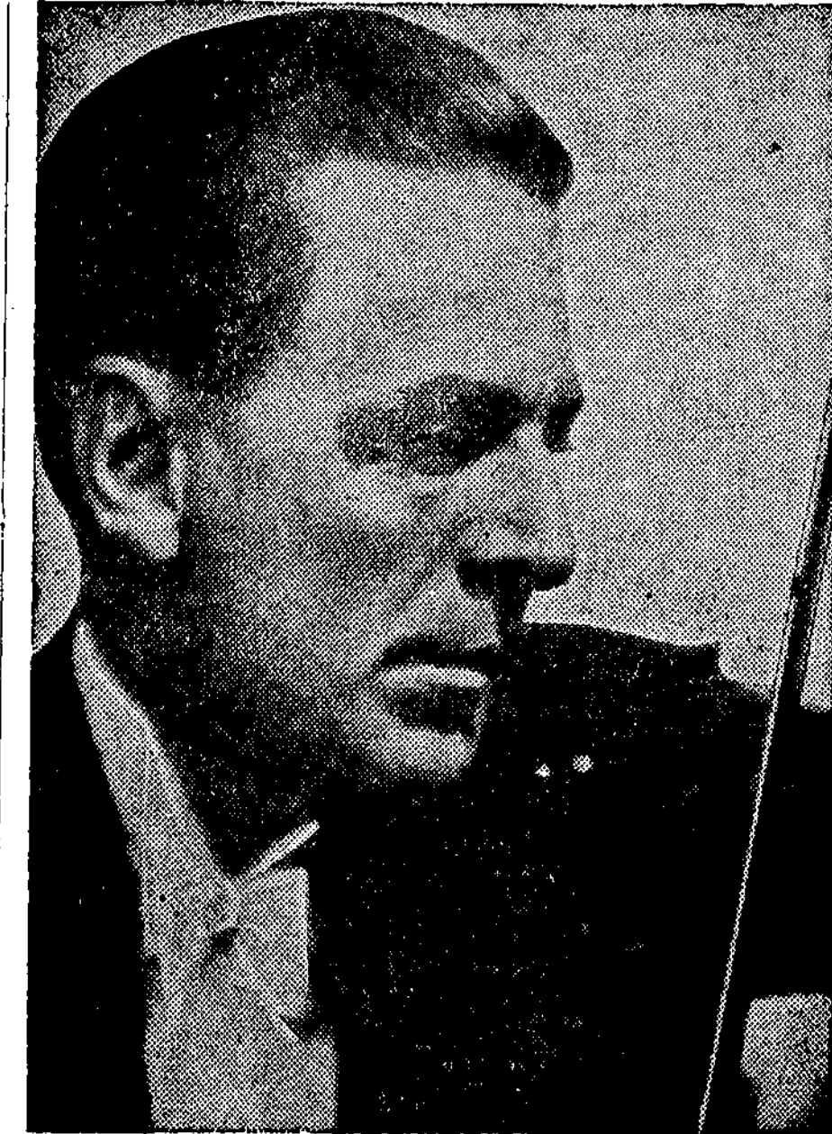
Booked for a concert here next month, Albert Spalding is the main attraction in the membership drive.