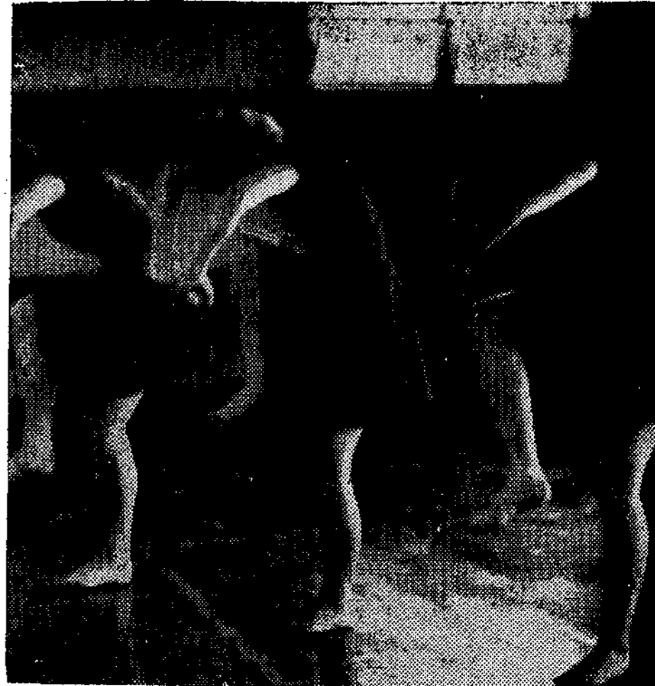
Practicing one of their routines, this part of the Texas State College for Women Dance Group was joined by the rest of the troupe for a performance Tuesday night in Russell auditorium.