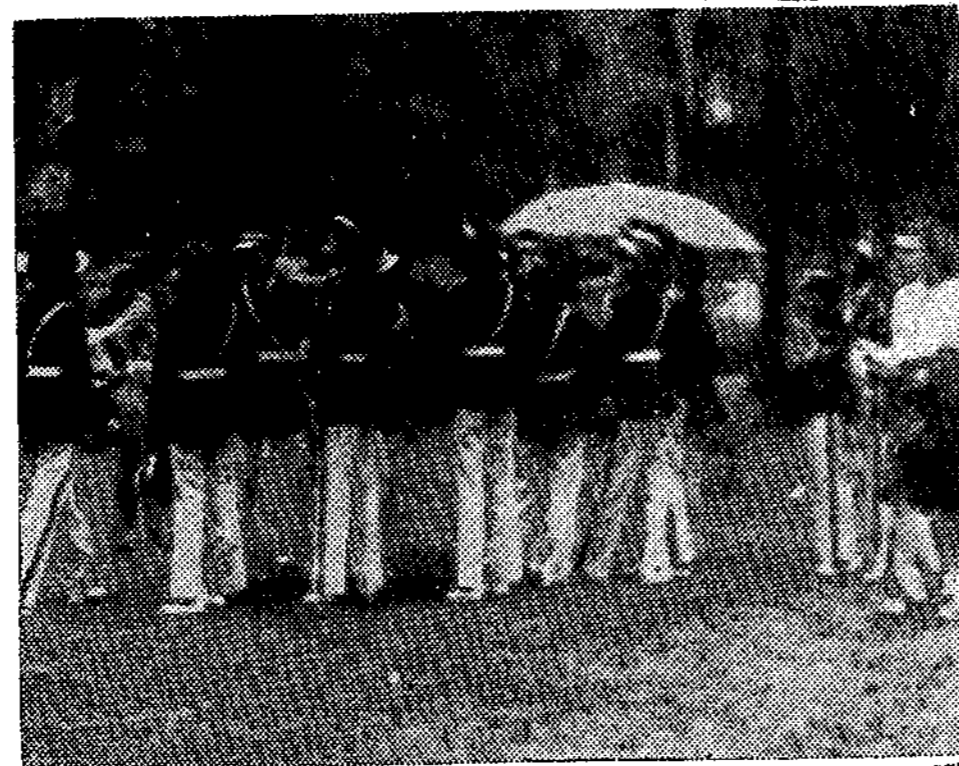
One of the 30 bands that attended the State Music festival Monday is seen warming up before the parade from GSCW to GMC.

According to Clapper, a settlement plan submitted by O.P.M. in the Allis Chalmers situation was agreed to by the workers but