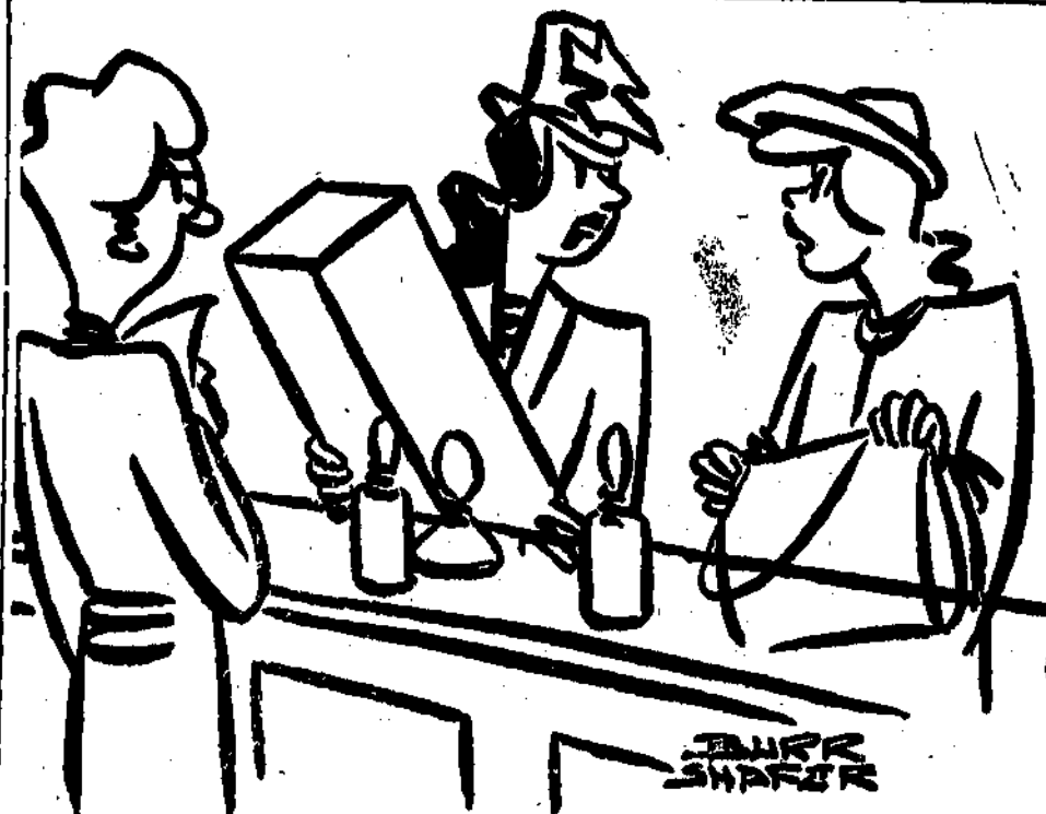
from the May issue of Esquire "He never could hold a job—now he's been discharged from the Army!"