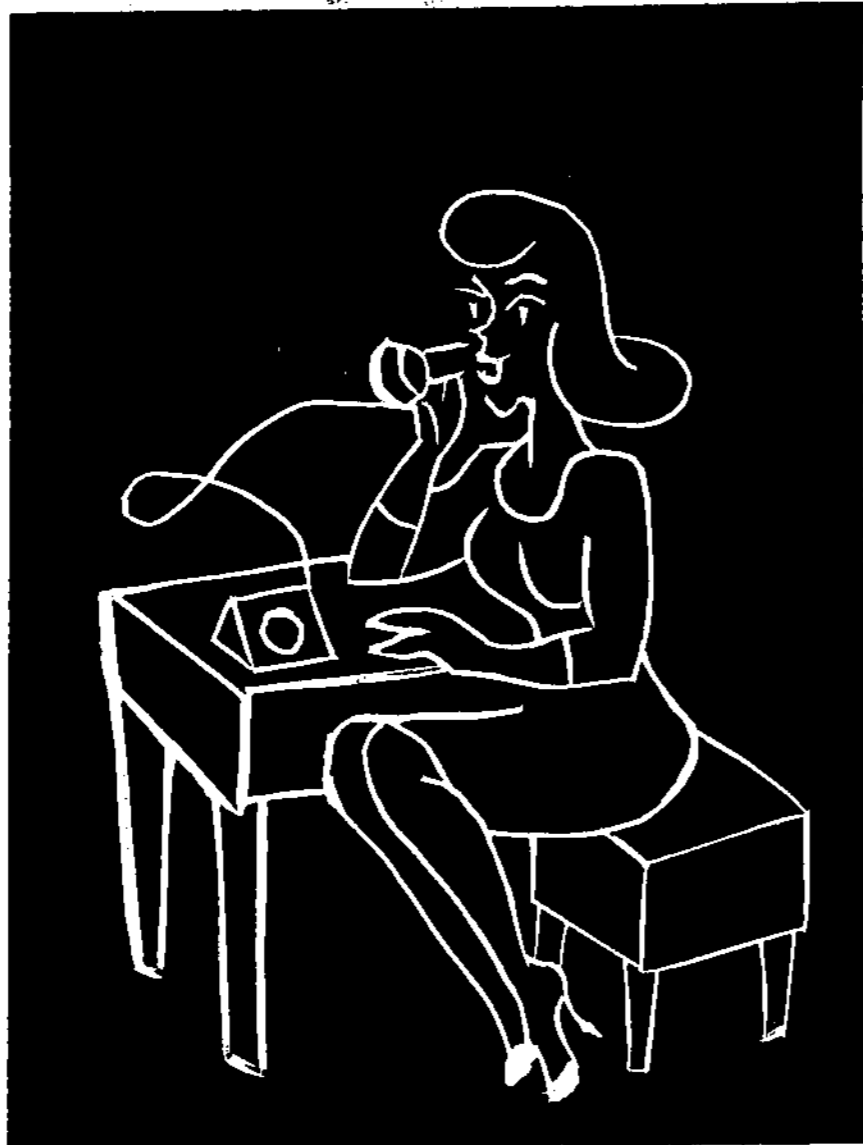
"What do you MEAN, 'The Wrong Number'? I'm a Jessie and you're a man....."