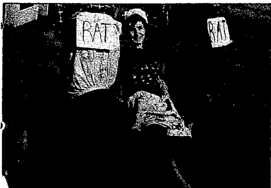
Mention of Rat Day terrifies the Frosh who usually enjoy the day