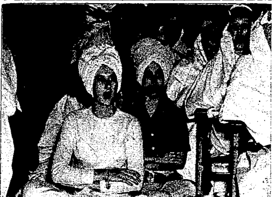
Imagination runs riot when Golden Slipper themes are named