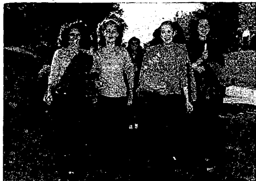
Annual hikers enjoy food station en route to the meadow.

An officer should believe in the purposes of CGA as expressed in the preamble of the constitution. She should desire to have a part in building a strong CGA on our campus, with every student having a share in its functioning and its development.