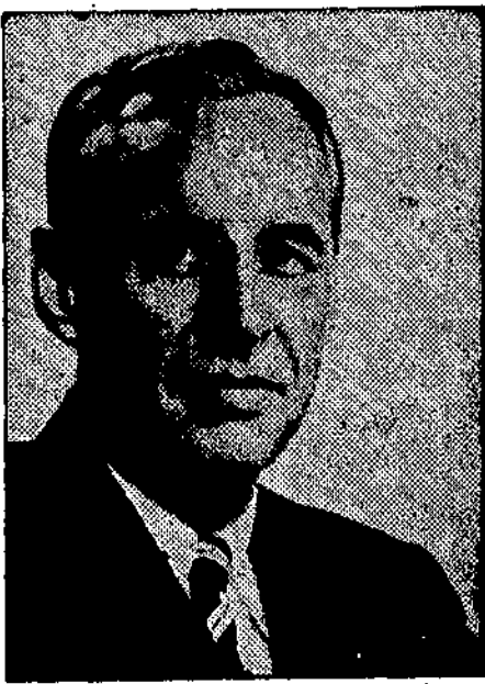
DR. F. S. C. NORTHROP

Dr. F. S. C. Northrop, distinguished philosopher and educator will appear here on the lecture series, Feb. 24, in Russell Auditorium. Dr. Northrop is Sterling Professor Philosophy and Law in the Law School and the Graduate School at Yale University.