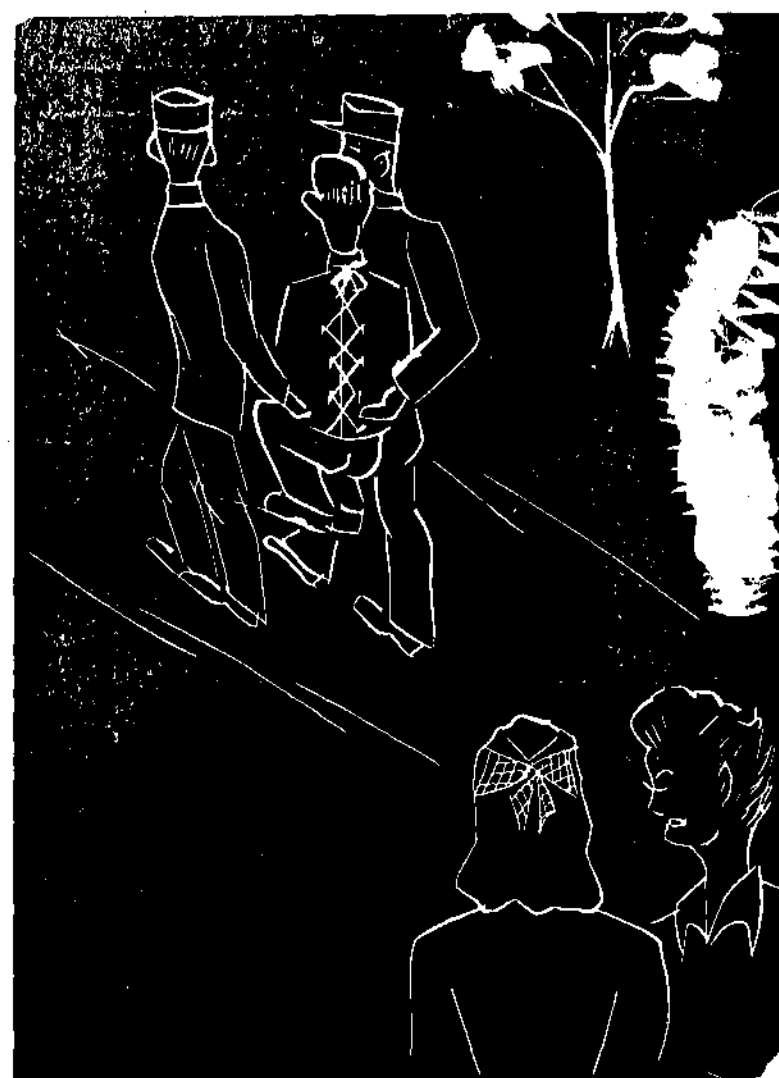
One of his students said "Human" when he asked her what form of nature she studied over the holidays.

The reason for checking quality points is to see that extra-curricular activities are not taking time away from girls who need to study.