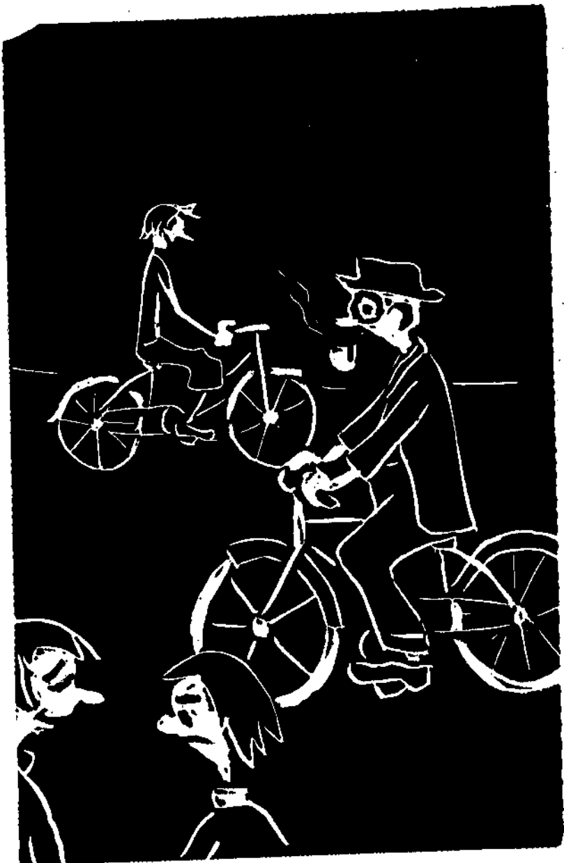
Sometimes I think it would LOOK better if faculty were not so modern-minded.

Now all we'd like to ask is—how about a return engagement next year or something on the same order?