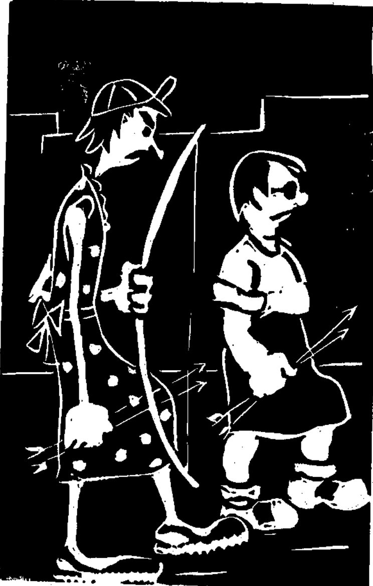
P. E. may mean Physical Education for Some People but it means Physical Emulation for Me.

With the friendliness and cooperation I have received from everyone on campus this week I think my jitters will be gone by the time the next issue goes to press. As for this issue, all I can say has already been said, "Give me this day my daily idea and forgive me the one I had yesterday."