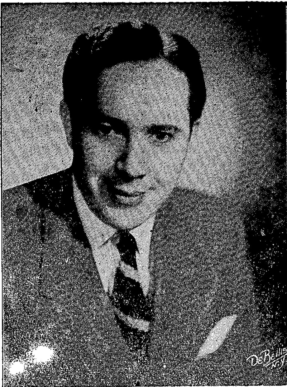
IGOR GORIN, young baritone, to open the Community Concert Series, October 19, in Russell Auditorium.