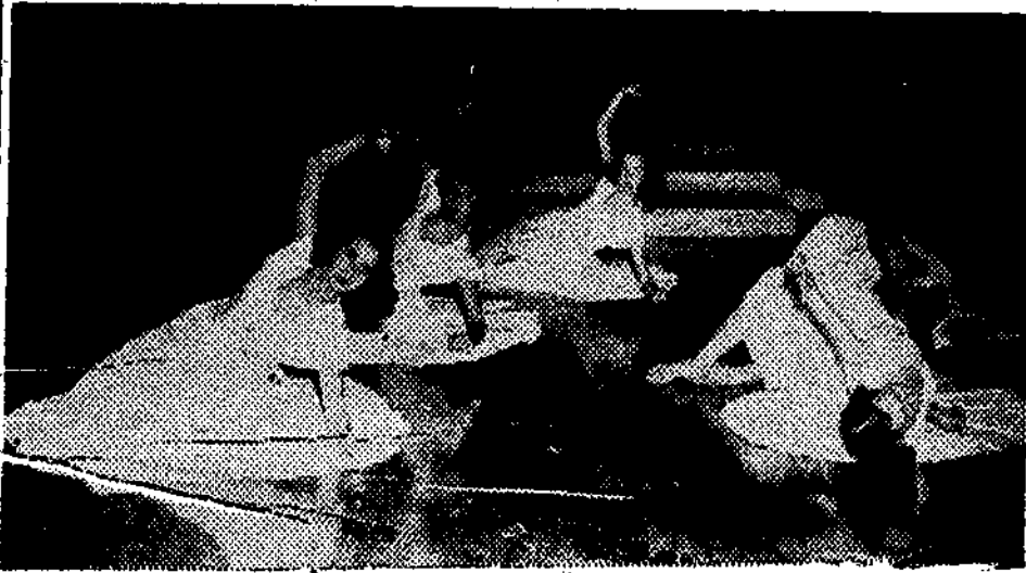
THE MODERN DANCE CLUB, which gave their first performance of the year in Russell Auditorium and did repeat performances in Gainesville and Demorest last week.

March 14 8:30 — 10:30 First period classes Humanities 200. 11:00—1:00 English 101 English 102 Soc. Sci. 210 Soc. Sci. 211 2:00—4:00 Soc. Sci. 103 Soc. Sci. 104 English 206 March 15 8:30 — 10:30 Second period classes, Health 100. 11:00—1:00 Third period classes 2:00—4:00 Fourth period classes Biology 100 March 16 8:30—10:30 Fifth period classes 11:00—1:00 Sixth period classes 2:00—4:00 Conflicts Chemistry 102 exam to be announced. Registration for spring quarter: Monday 13, 2:00—4:00. No regular classes from 2:00—4:00. Freshmen and Sophomores by committee in classrooms; Juniors and Seniors in Library.