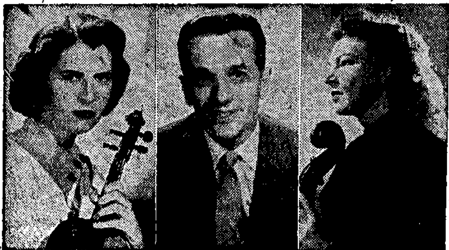
THE COLUMBIA PHILHARMONIC TRIO