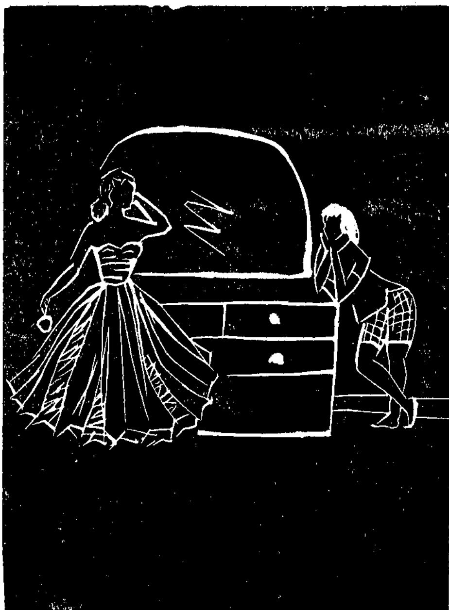
I've A Date With A Red Convertible