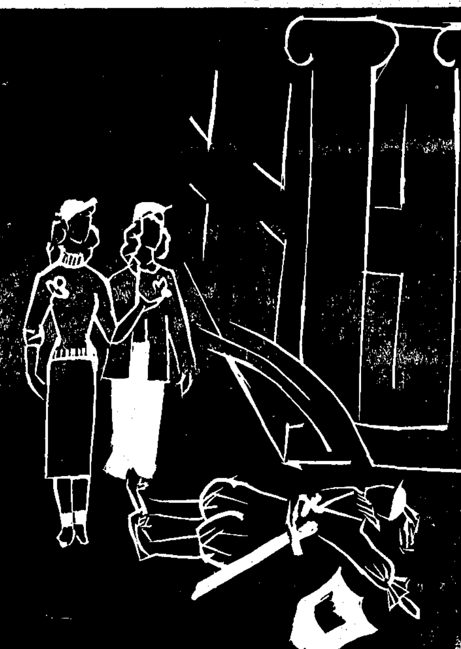
"All I Did Was Command Her to Go Rest For An Hour"