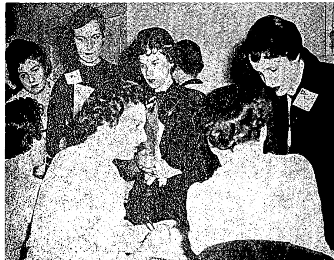
The Hetic Registration—The college girls registered the high school seniors.