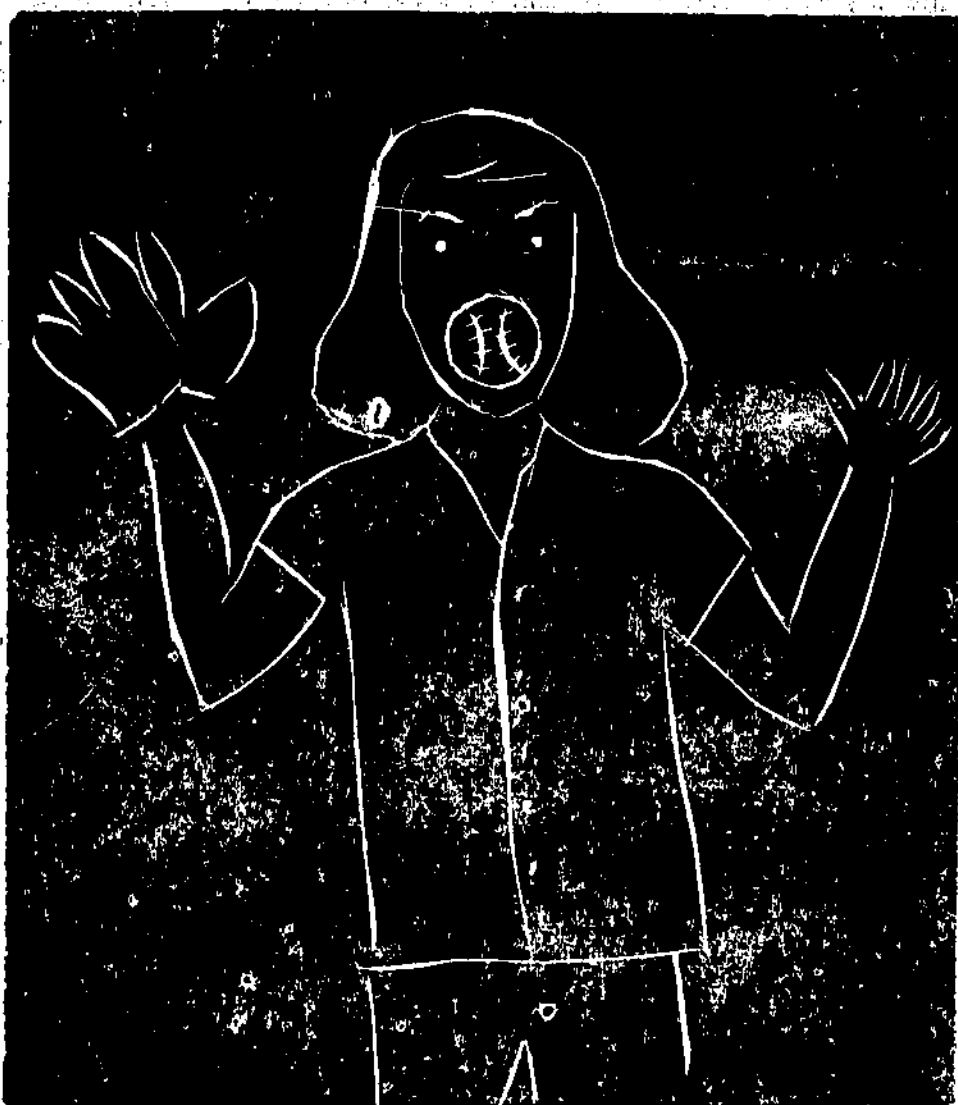
I've got ..... "H".

When we read our school paper, it shows that we are interested in our school. Everybody should read it. Do you or don't you?