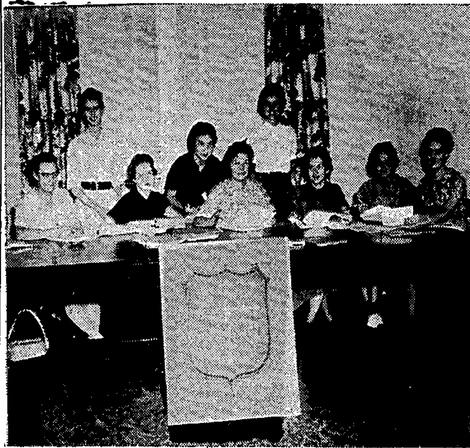
Honor Council Makes Preparations For Honor Week

As is obvious to all, Honor Week is not one of those weeks set aside with a run-to-this meeting or program and then-to-the-next-schedules. This is planned so with the express purpose of giving students time to think constructively, therefore, essentially, much of the planning and the way in which GSCW's first Honor Week is carried on will be determined with the student body.