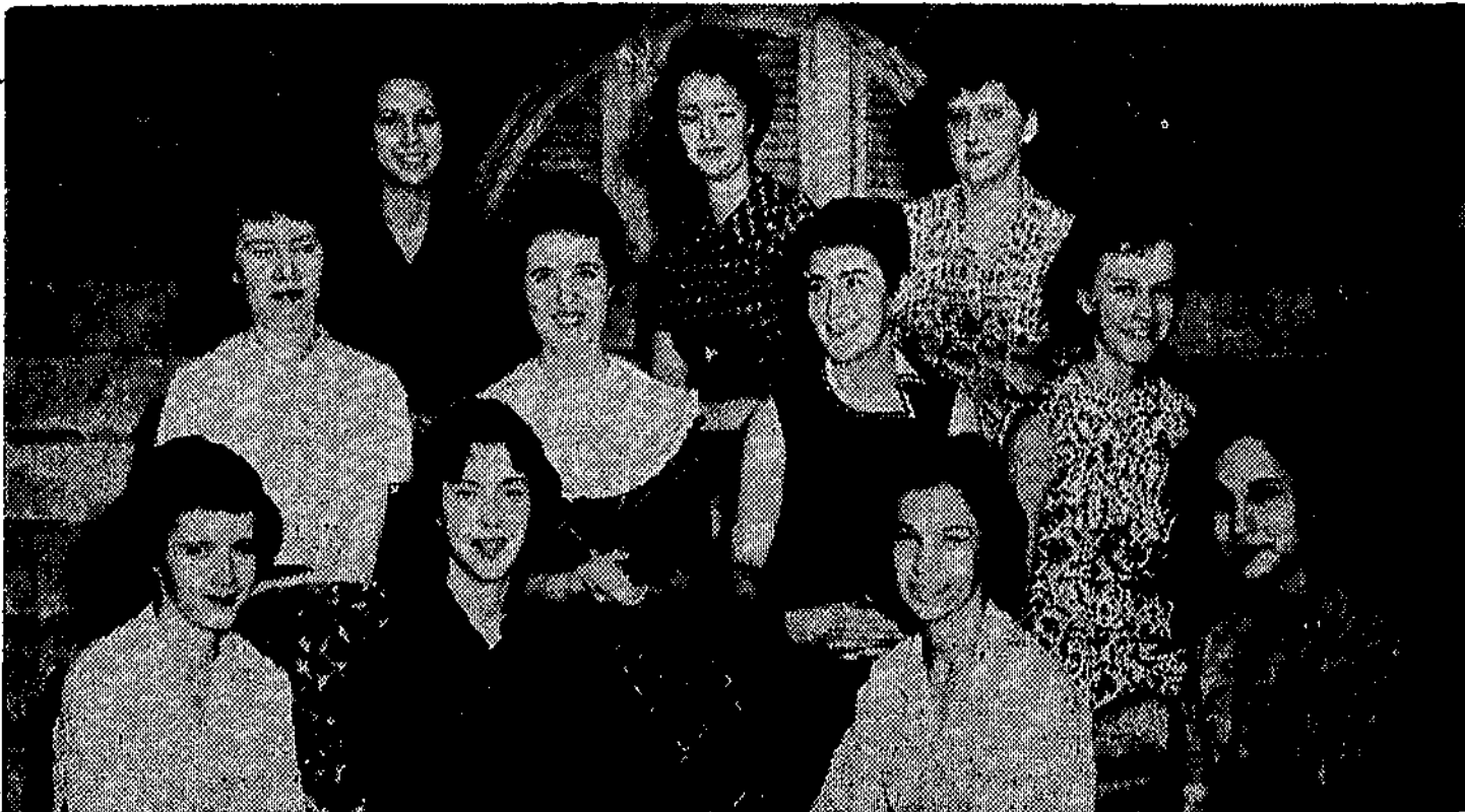
New COLONNADE Members