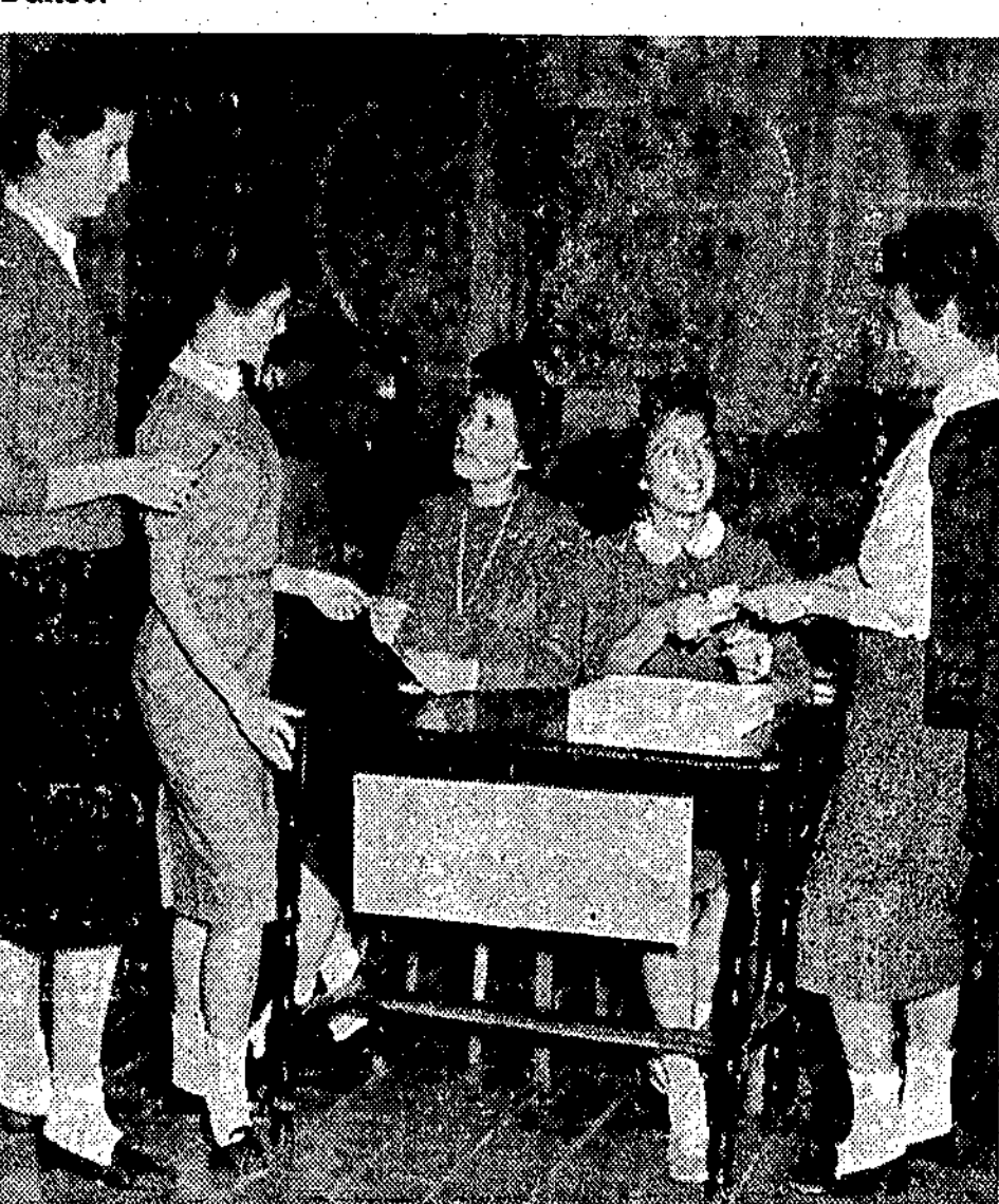
Students buying tickets to Scholarship Dance

Take something old and something new, add a touch of spice, mix well with much fun, and serve on a platter garnished with true generosity. This is the recipe for the 1959 Scholarship