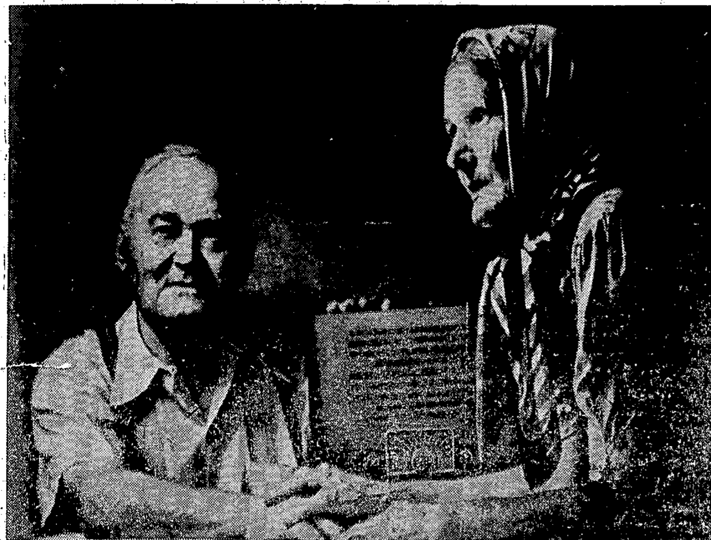
Radio broadcasts from the Free World are tearing an increasingly larger hole in the Iron Curtain.

Russians will gather around their radios on Christmas day; because, on this special occasion they will be able to hear a program from the free world — one of the few uncensored things that ever reach them.