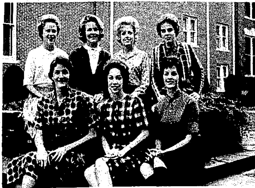
Newly-elected Freshman officers and representatives pose in formal garden.