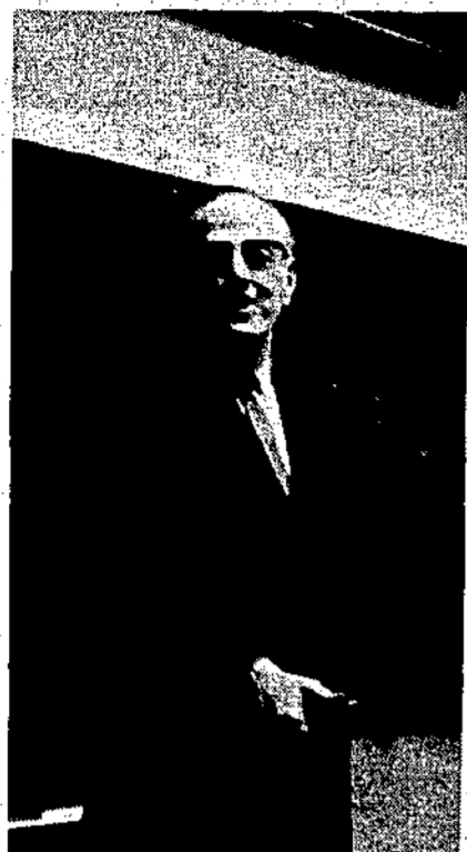
Dr. Walter Judd