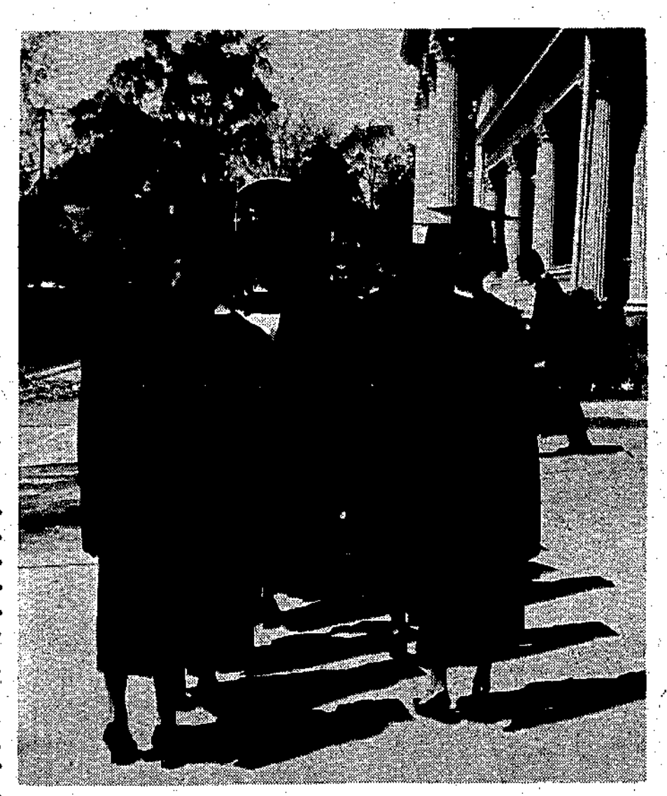
Phoenix members assemble before the Honors Day ceremony.