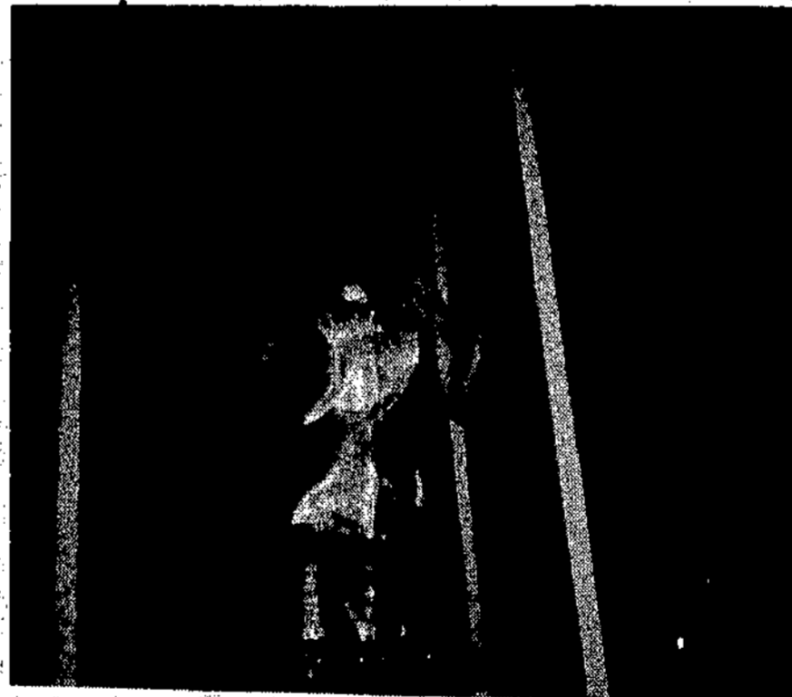
Deanie a' Whoa-Whoa