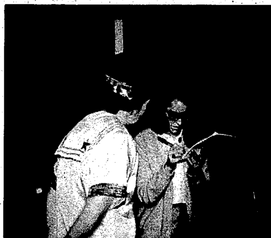
"... I have been rehearsing many years..."