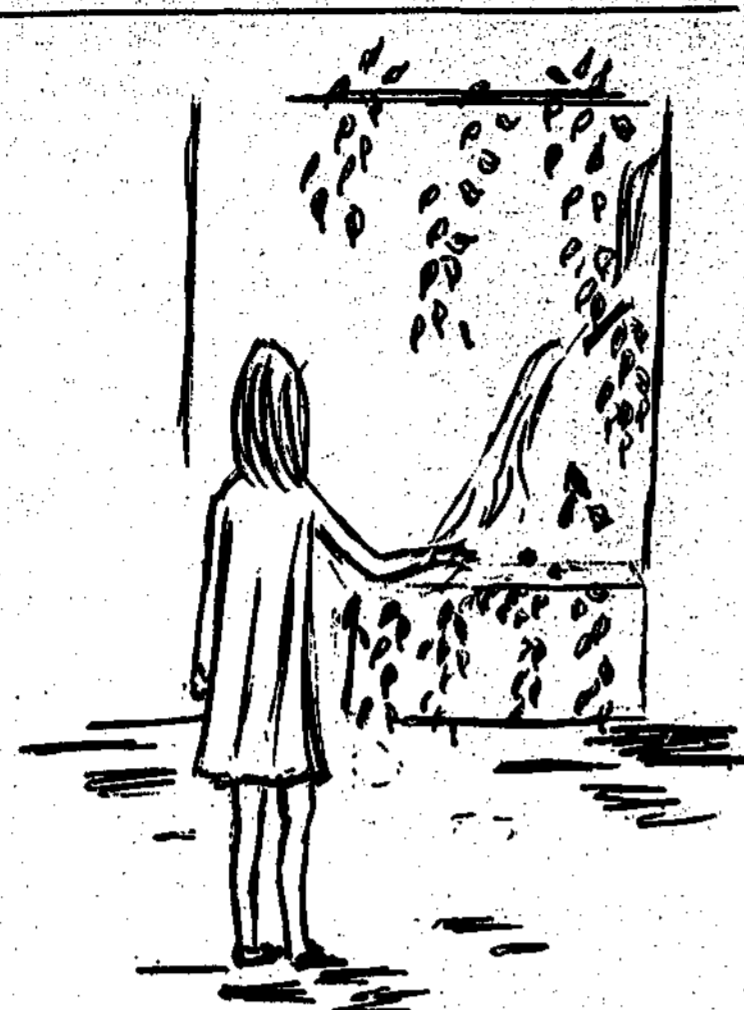
Wishing success to WUS

The purpose of the Colonnade is to serve as a clearinghouse for student opinion, to treat controversial issues with adequate discretion, to feature topics of interest to students, and to report activities taking place on campus.