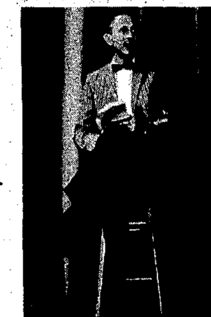
"... and we tried harder!"

ded a film on WUS work in the Far East (Monday) a Faculty Talent Show (Wednesday), and a wishing-waterfall (Thursday).