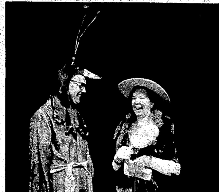
"It's the audience that makes it funny."