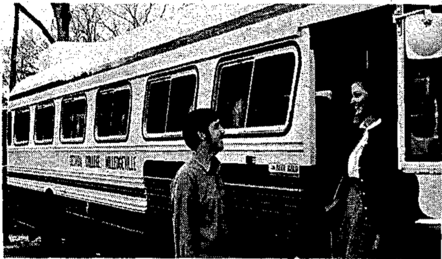
...the arrival of the GC Bus,...