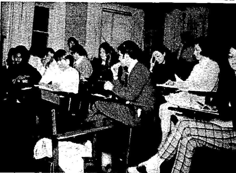
This is about the average recent turnout for the Student Senate meetings.