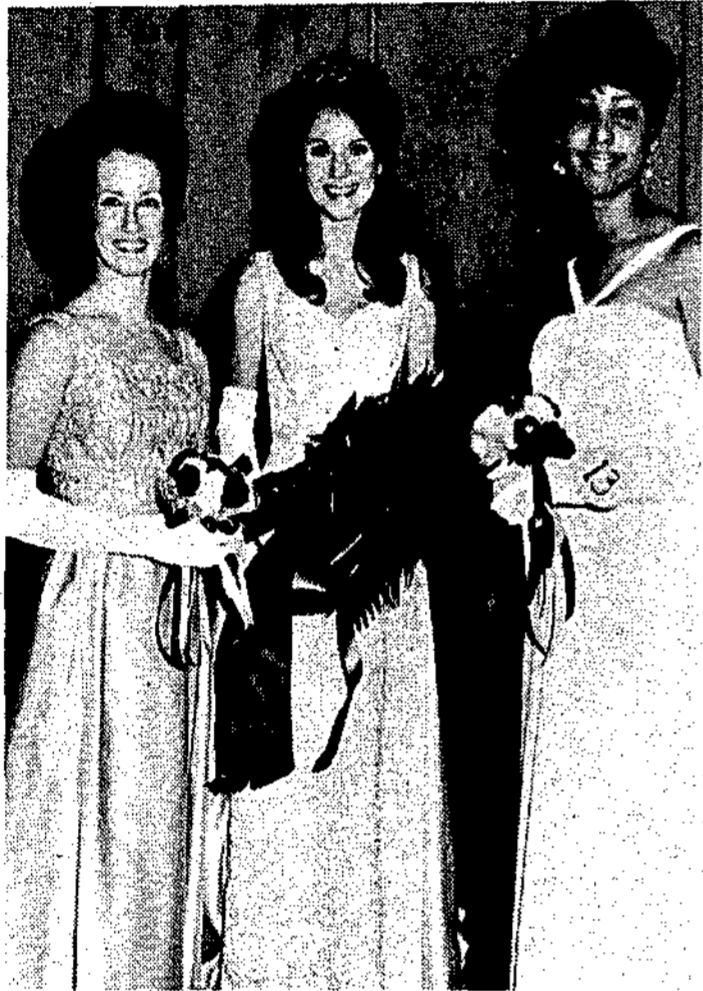
...the Selection of Miss GC,...