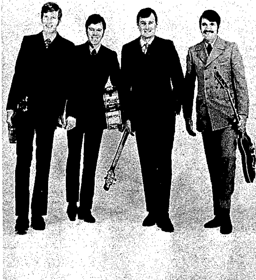
The Town Criers, nationally known singing group, will perform on the Georgia College campus during Spring quarter. Watch for posters to learn all the details.

Students of Georgia College should make a special effort to see this concert. Watch for posters which will inform you as to the time and cost of the performance. If you miss this, you may very well miss the best concert Georgia College has ever had.