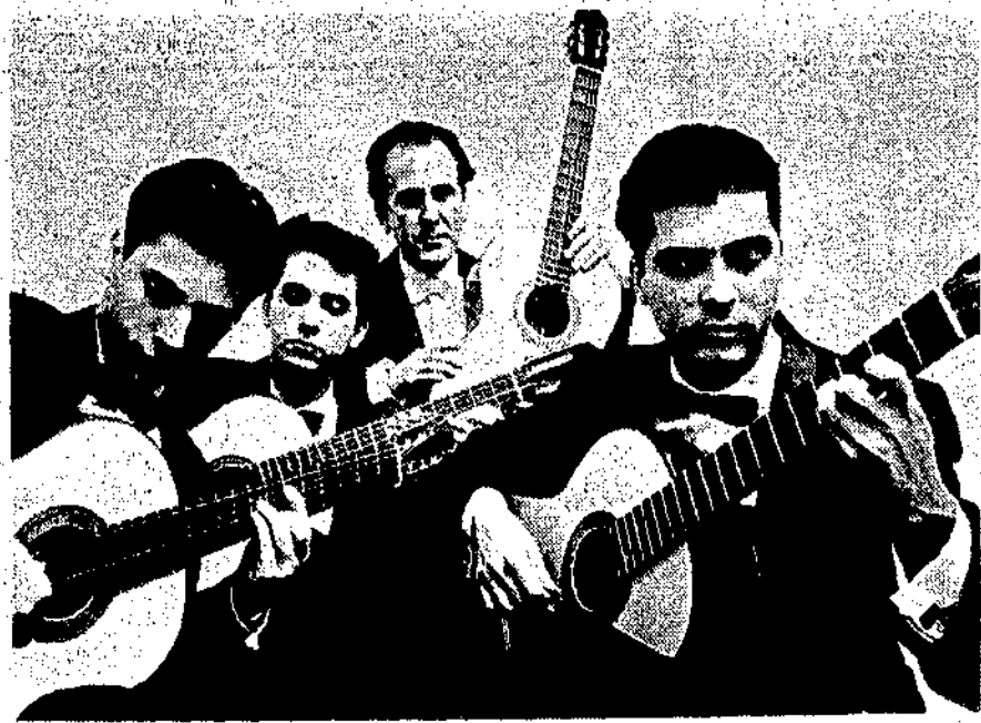
The Romeros will perform on the stage of Russell Auditorium on Thursday night, March 12, presented by the Community Concert Association. Students will be admitted with their IDs. Showtime is 8:00.