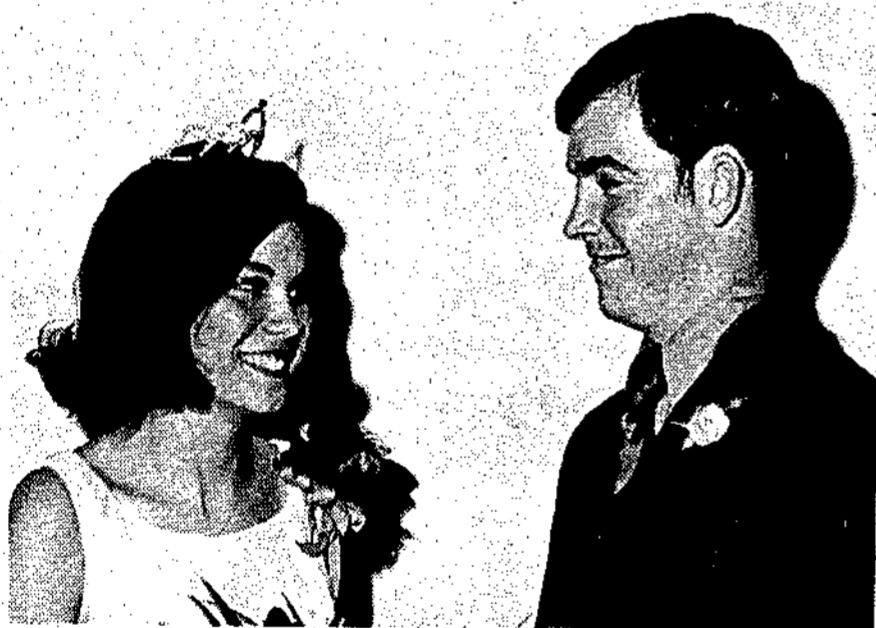
...the Crowning of Miss Aurora,...