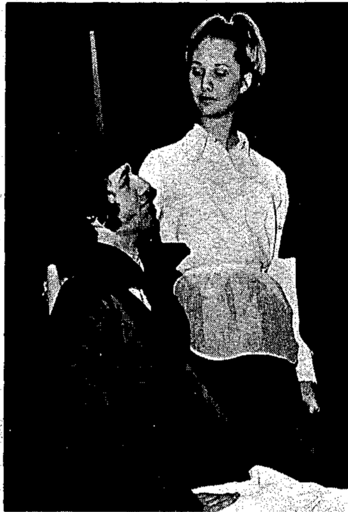
...the production of "The Firebugs,"...