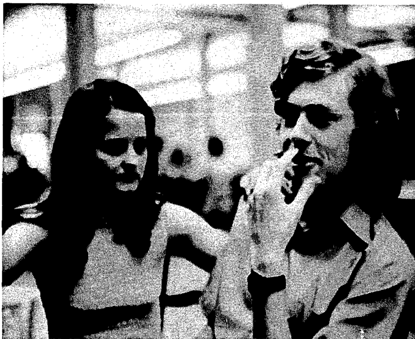
Two innocent BY-STANDERS AT LUNCH SEE AN INTERESTING SIGHT AS THE COLONNADE comes!