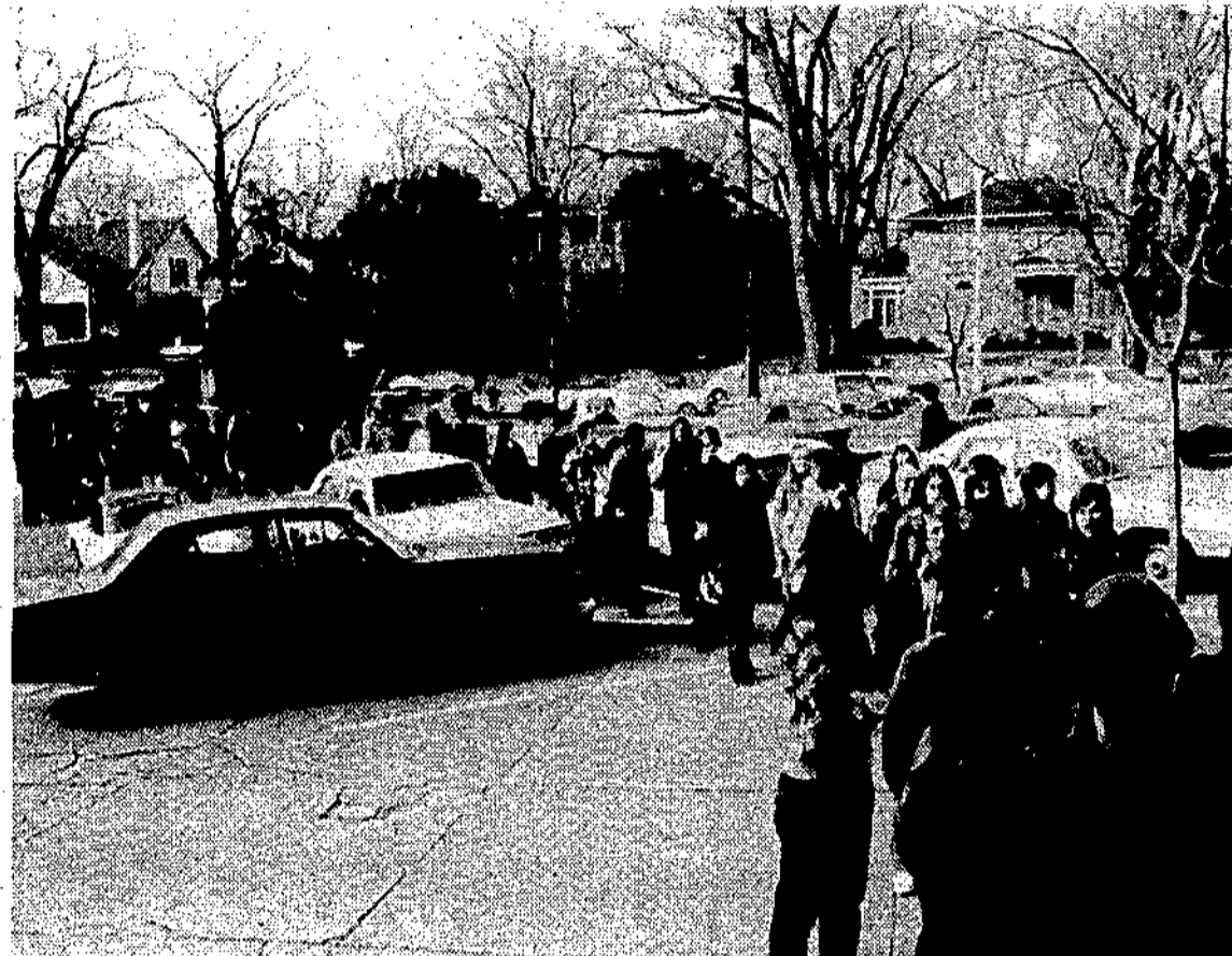
Deadline? No, merely GC students awaiting their turns at registration for Winter Quarter.