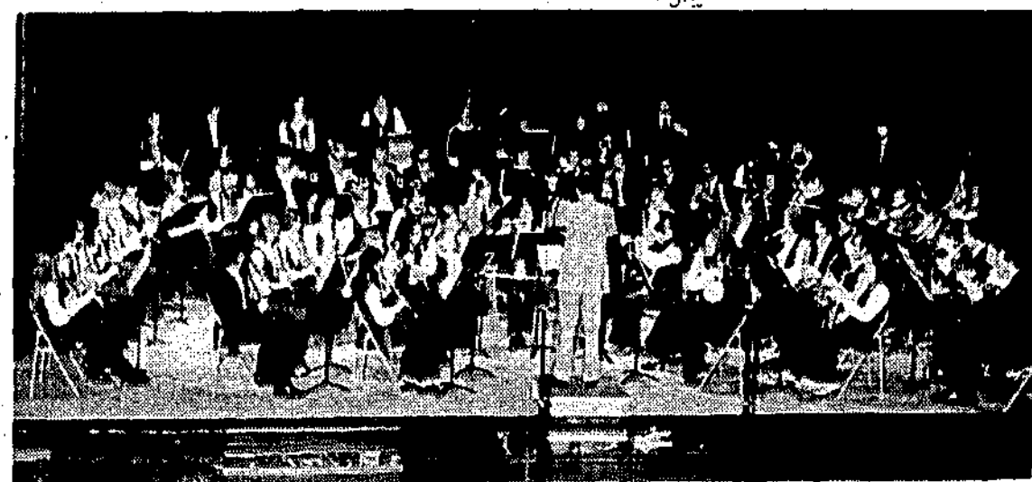
Georgia College Stage Band

There is a great reward in seeing children develop physically as well as mentally.