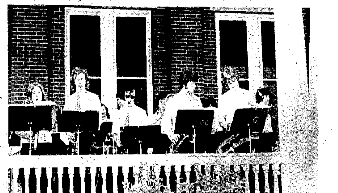
GC Stage Band entertains at barbeque.