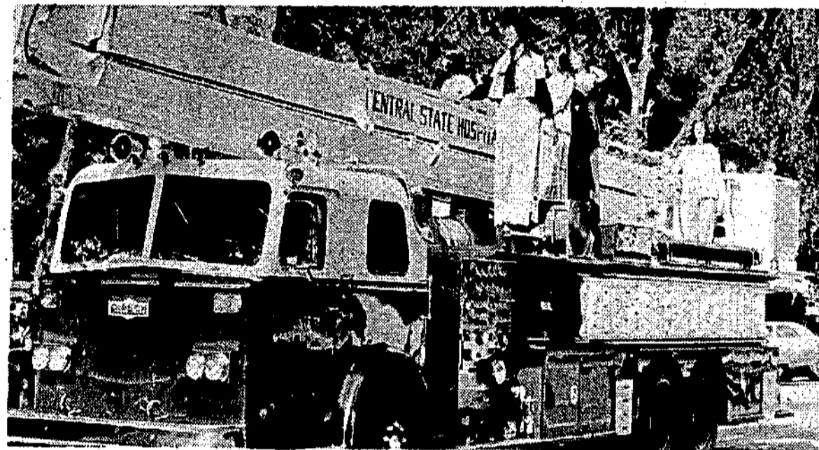
MISS HOMECOMING 1974 and 5 finalist lead parade.