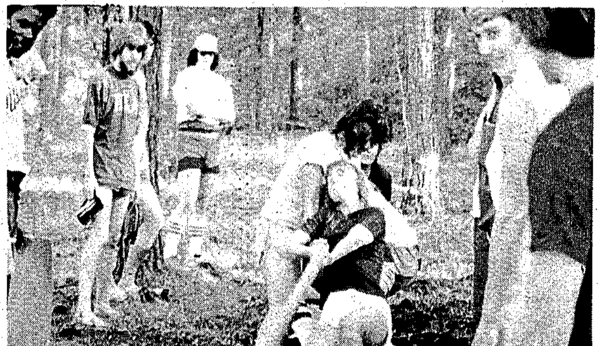
Georgia College students participate in field day events.