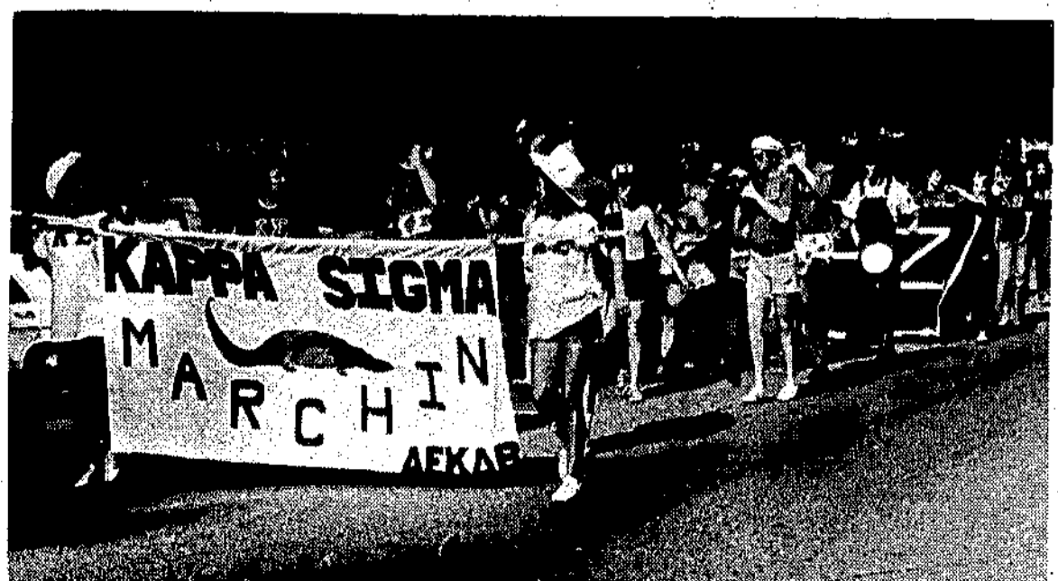
Kappa Sig does the 'gator walk.