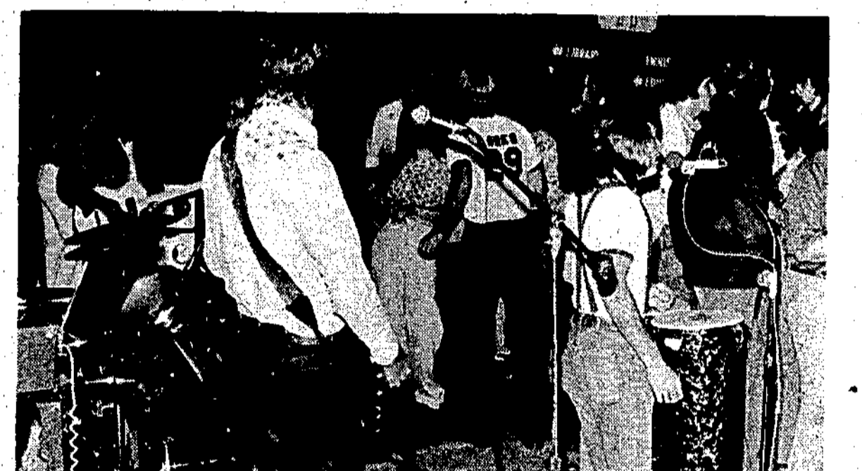
Cottonwood plays at informal dance.