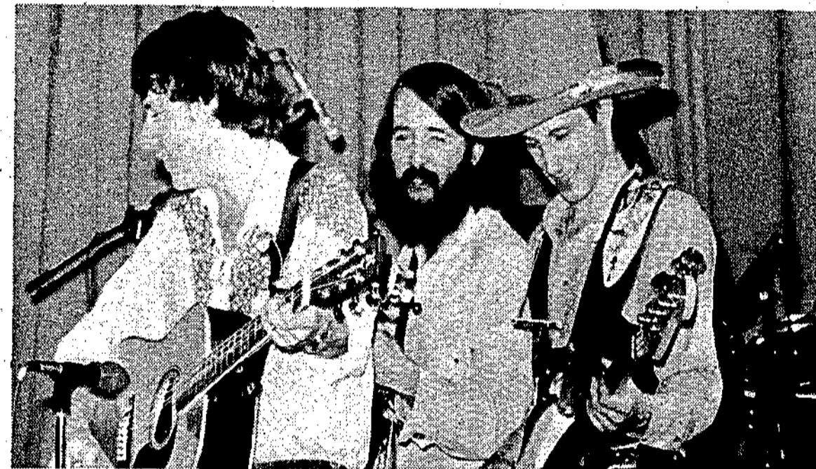
Concert starring Nitty Gritty Dirt Band.