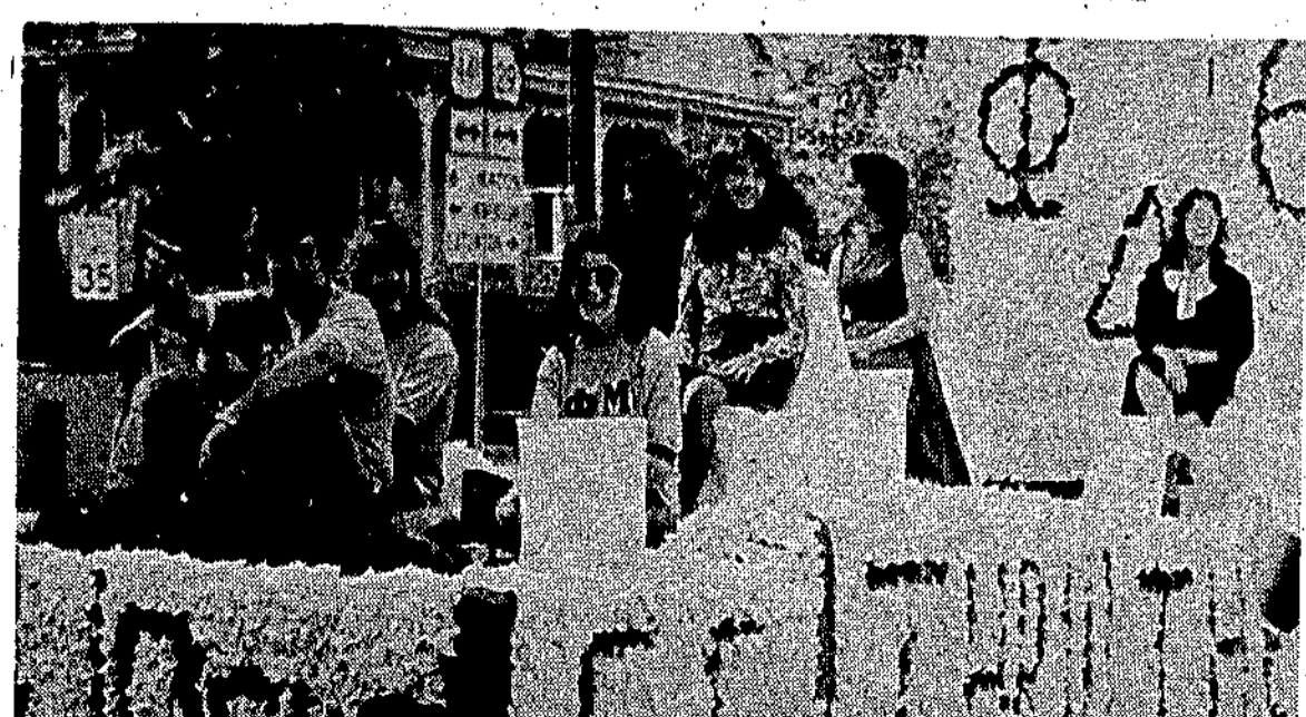
Phi Delt's "GC through the ages."