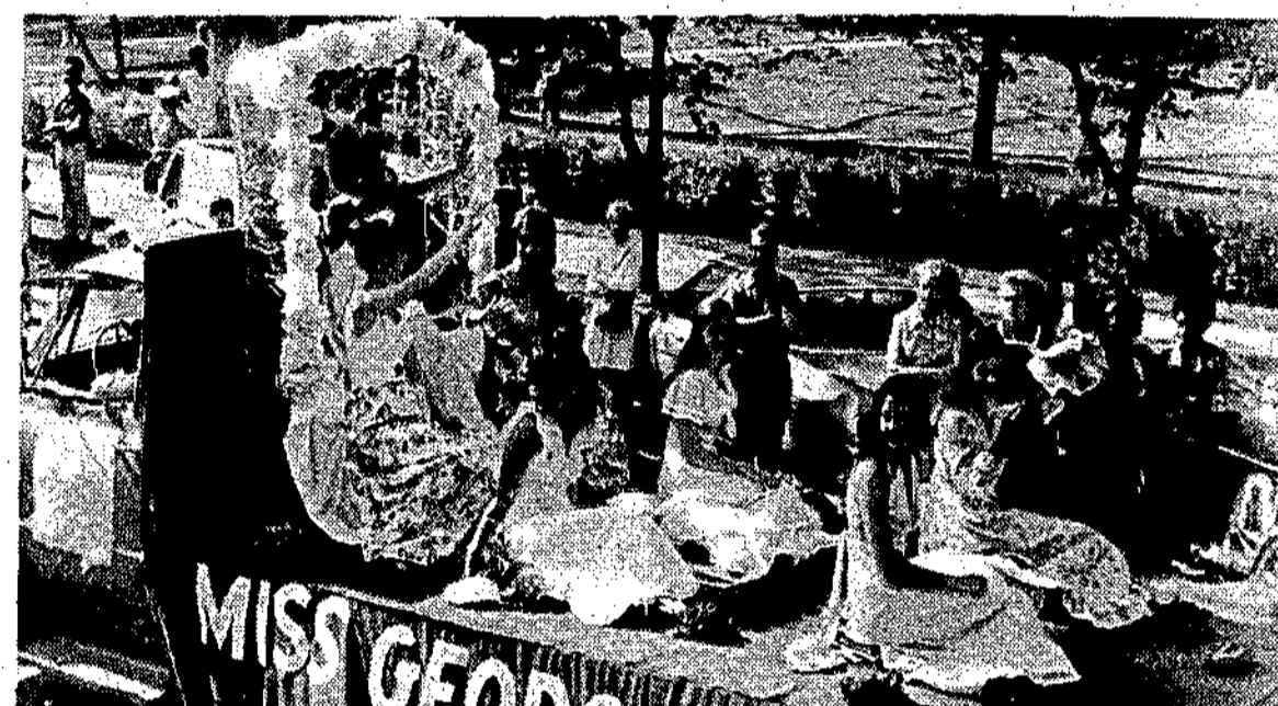
Miss Georgia College and court add beauty to the parade.