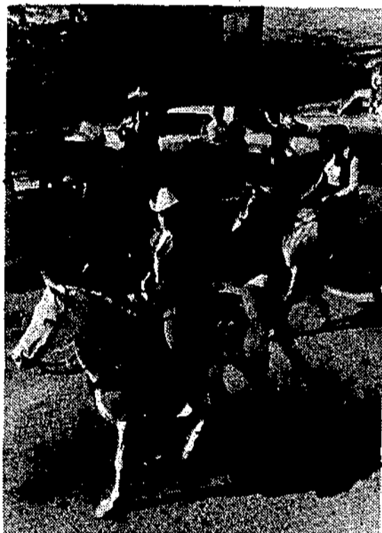
No parade's complete without horses.