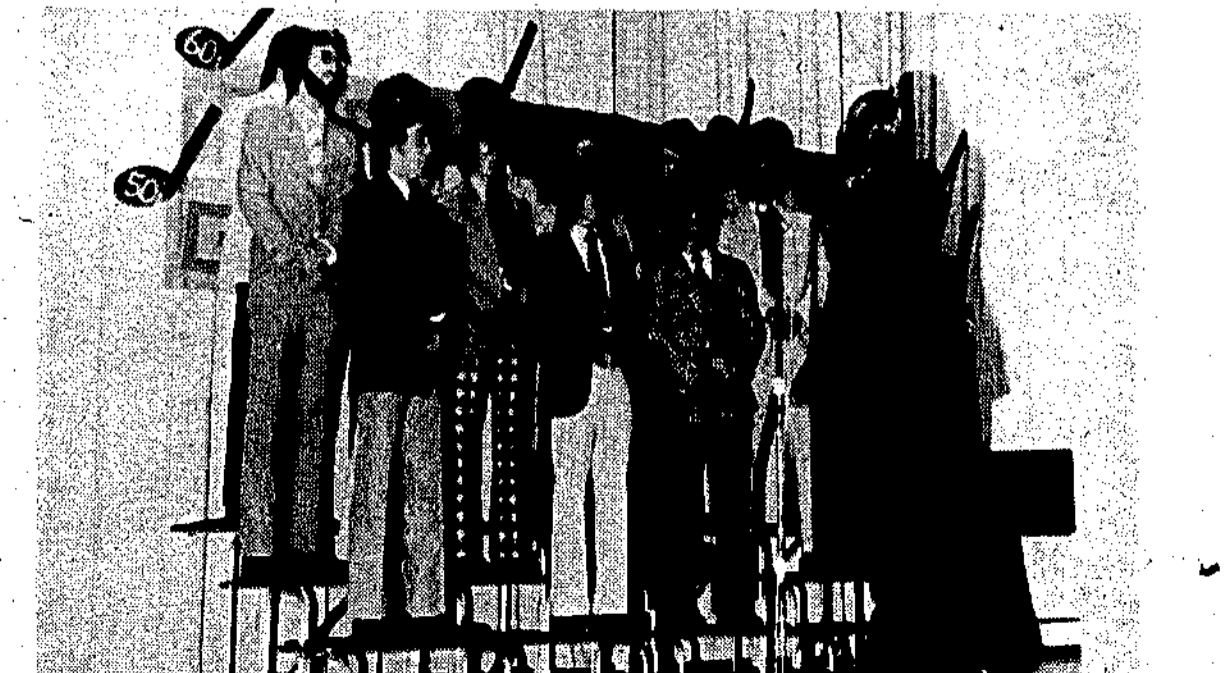
Participants in GC's First Annual Song Fest.