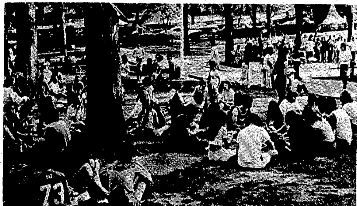
Outdoor barbeque on Friday.