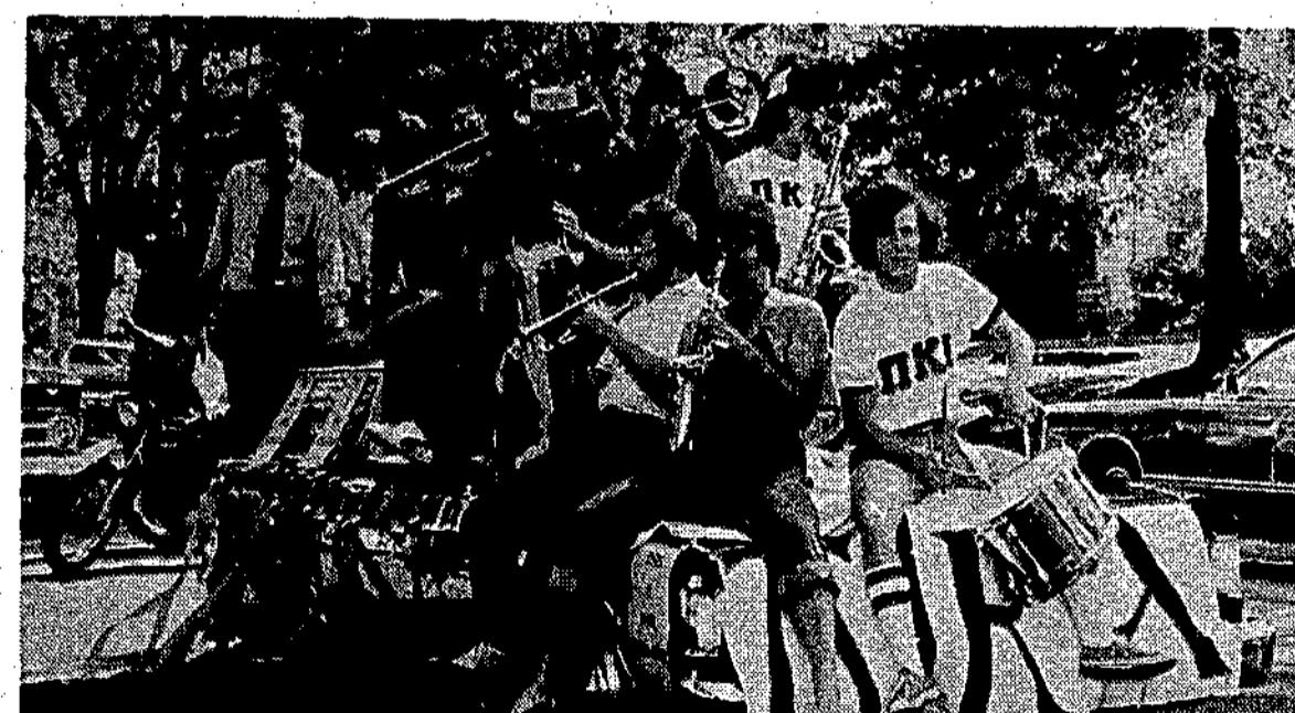
Pikes are tuned up.